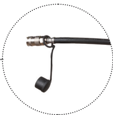
Second Medium Pressure Hose (Buddy Breather)