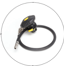
Quick-coupling Demand Valve